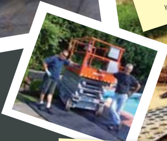
Suitable for any environment