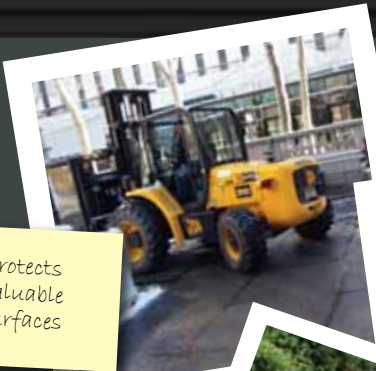
Protects valuable surfaces

TOLL FREE 877 762 8489 DIRECT 780 980 1166 FAX 780 980 2244