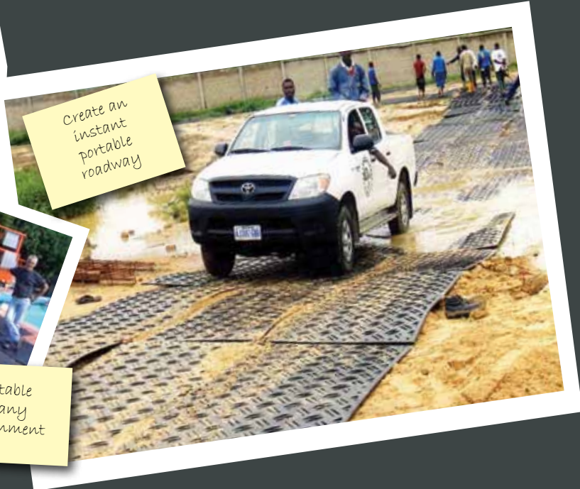
Create an instant portable roadway